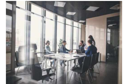
Travel and Business Peace of Mind Care