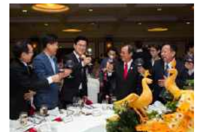
Organizing Various Brand Promotions, Sports Events, Festivals, and More