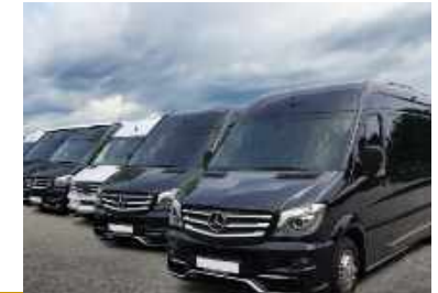
The customized premium transport service for groups