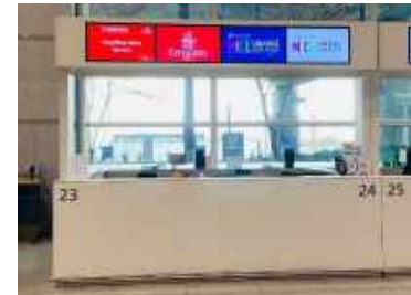
Incheon Airport Concierge Desks (T1/T2)

Continuous customer satisfaction concierge service 24/7/365