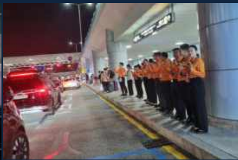
2023 KOAFEC Ministerial Conference protocol and transport