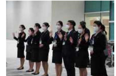
The staffs for your welcome 24/7/365