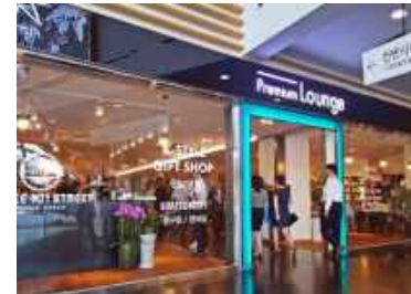
Premium Lounge Songdo Branch