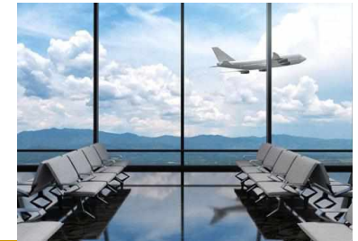
Medical and Airport Peace of Mind Care"