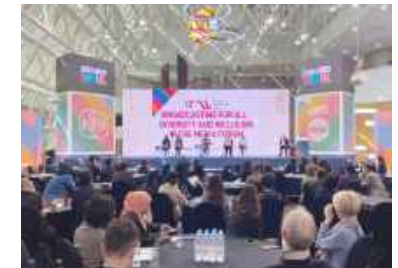
Expertise in tailored event planning and execution