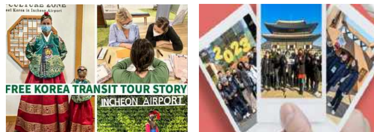
Operating Free Transit Tours and K-Stopover Tours

Delivering customer delight through development of theme-based, seasonal, and destination-specific travel packages