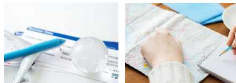
Tailored Tours for Incentives, Medical Tourism, Family Travel, Packages, and More