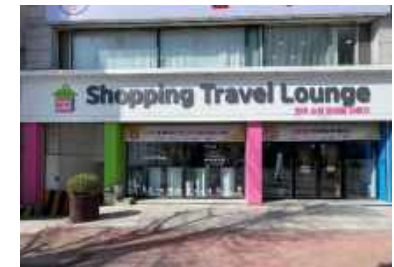
Jeonbuk Shopping Travel Lounge