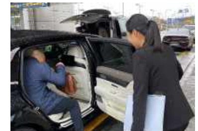
The protocol service until up the vehicle