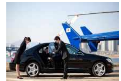
Global premium limousine service