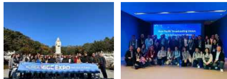
Customized Tours for VIPs, SITs, and More