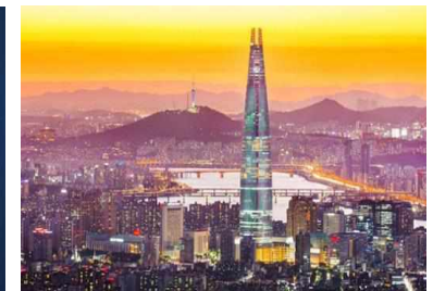
Traveler Peace of Mind Care Plus Over 20 Special Benefits