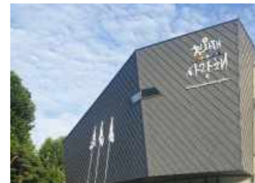
Blue House Sarangchae Café & Travel Lounge