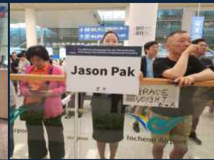
2023 Amazing 70 anniversary of the Armistice