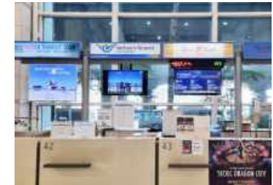
K-Stopover Concierge Desk