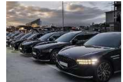
The customized premium transport service for VIP