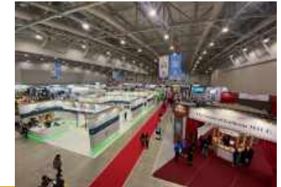
Hosting International Conferences, Conventions, and Exhibitions