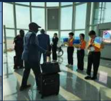
2023 ABU airport desk operation