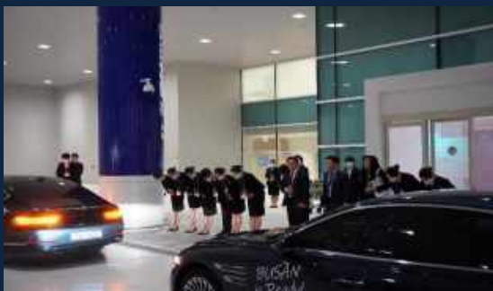
World Expo 2030 BUSAN KOREA